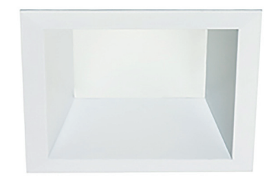
Hornet HD Downlight